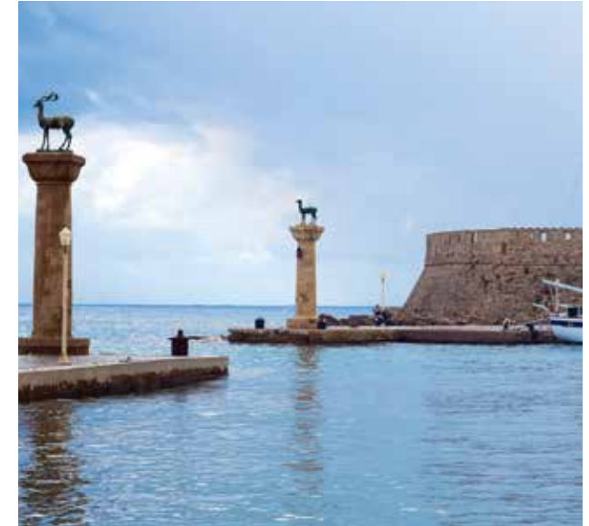
15th-century tower and fort of St. Nicholas in Mandraki harbor

a comprehensive agenda that was negotiated from 1973 to 1982 by virtually every nation on earth. The culmination of this largest negotiation in history was the adoption of the United Nations Convention on the Law of the Sea 1982.