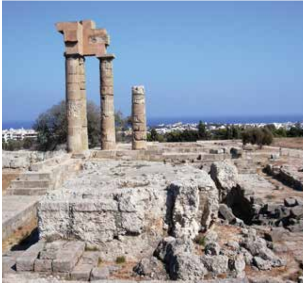
Ancient temple ruins on Rhodes Acropolis