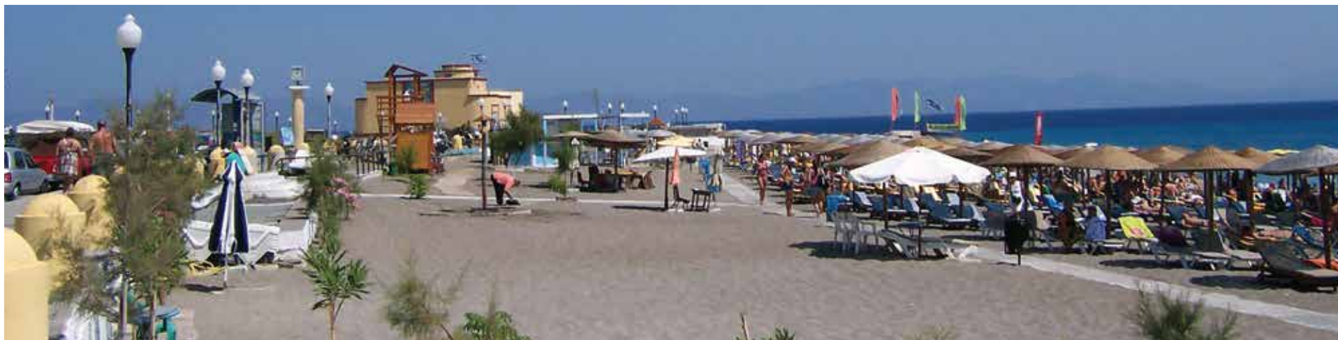
The beach in front of the Mediterranean Hotel (where participants usually stay), with the Aquarium in the distance

The 1982 Convention contains more enforceable provisions dealing with the environment than any other multilateral treaty. Specific agreements developed under the aegis of the International Maritime Organization apply to commercial shipping based on flag States and classic maritime rules. The interface between global environmental standards and their enforcement is explained, often by experts who are or were personally involved in setting up the regimes. The community interest in freedom of navigation through and over international straits and oceanic archipelagos is discussed as is the sovereign immunity of military vessels. An environmental workshop and a navigation seminar may be given on the two afternoon sessions during which spirited debate is expected. An optional examination is offered at the end of the second and third week for students seeking a Diploma from the Academy.