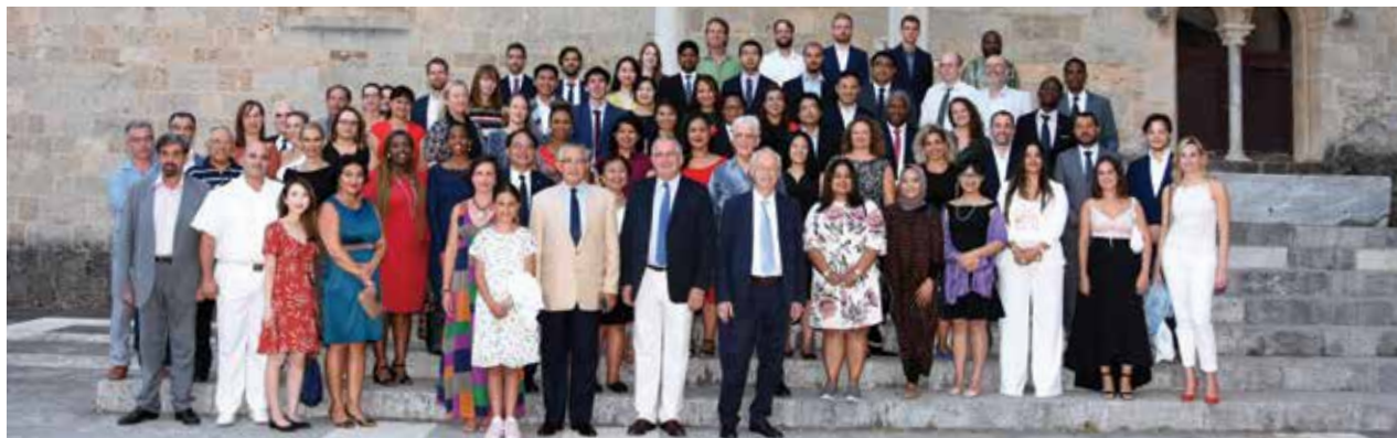
Class of 2019