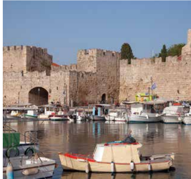
Harbor view of medieval city walls of Old Town