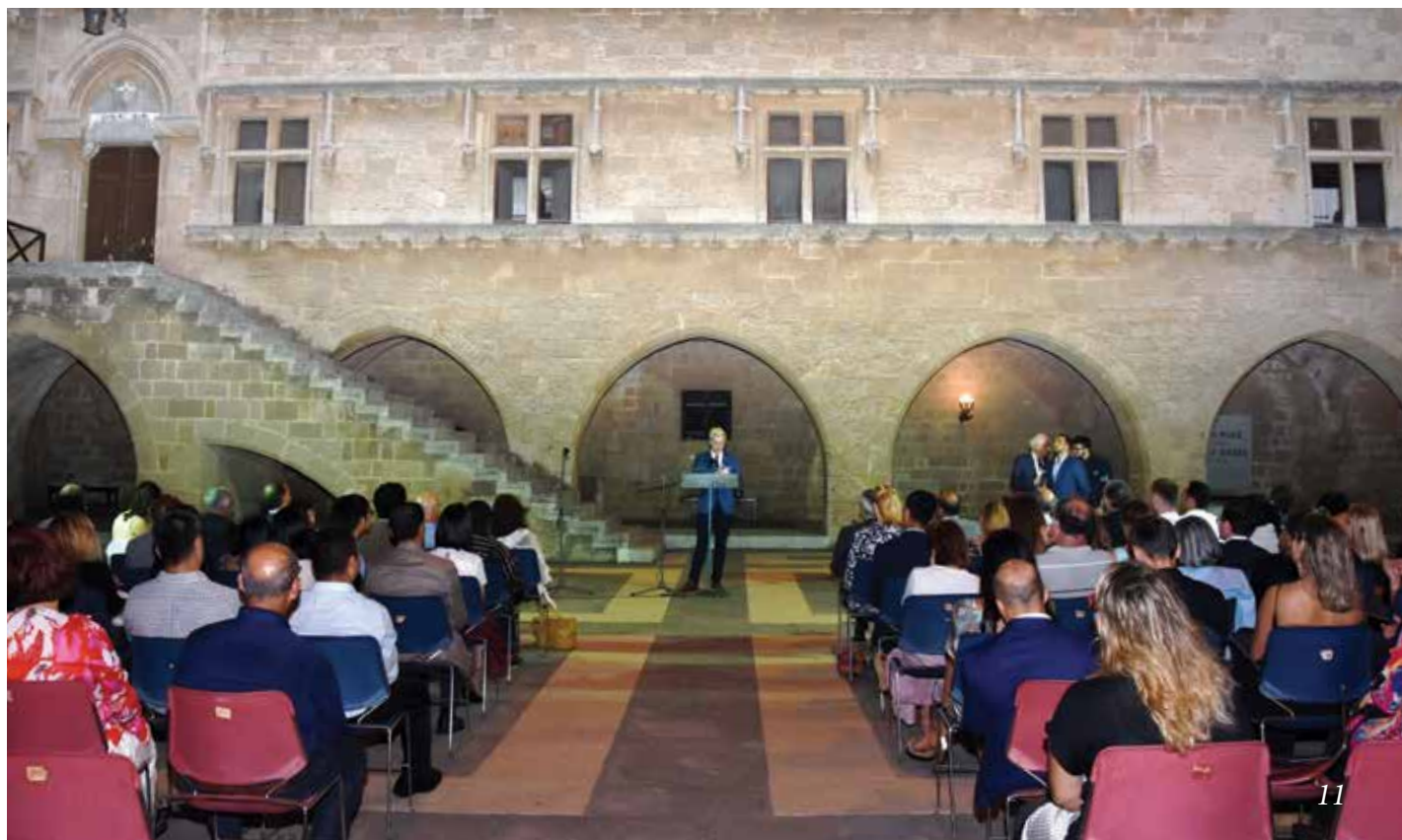
Graduation ceremony, 2018

Judge (Republic of Korea) and former President, International Tribunal for the Law of the Sea