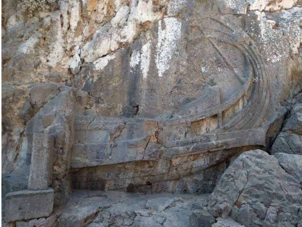
Rhodian ship (trireme) of the 3rd-2nd century B. C. carved on the rock of the Acropolis of Lindos, Rhodes. Triremes are named after the three lines of rowers arranged down the length of each side of the ship. The dense forests of Rhodes provided building materials for these effective warships.