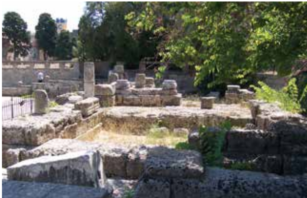
Ruins of Temple of Aphrodite