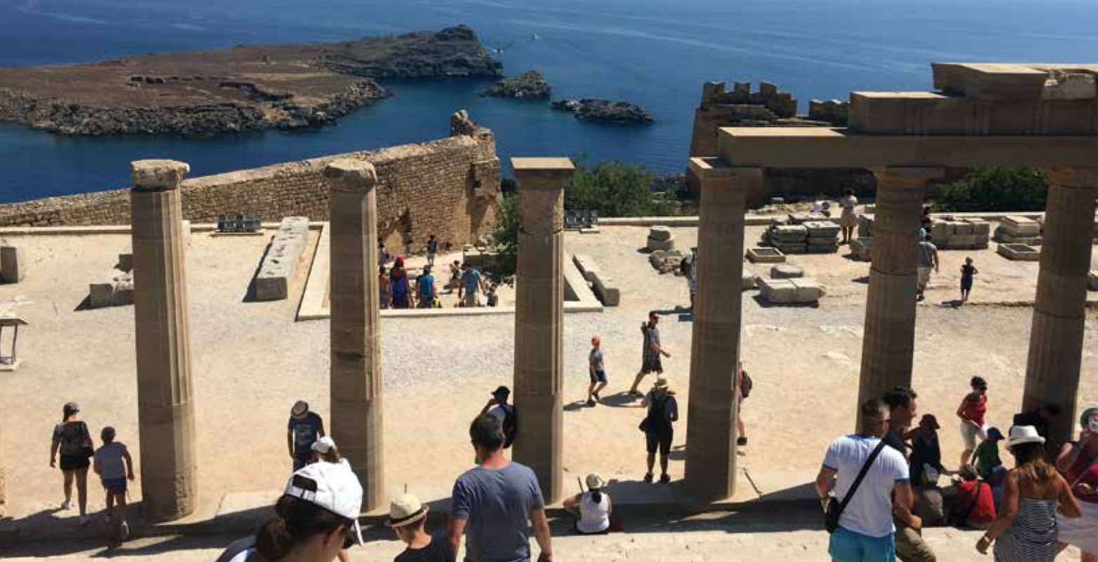
Day trip to nearby Lindos