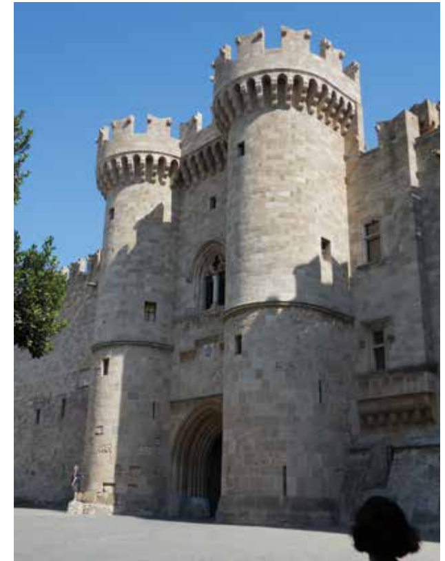
Palace of the Grand Master of the Knights of Rhodes, a medieval castle

The 1982 Convention has been ratified by 168 Parties as of early 2021, and is widely considered as reflective of customary international law in almost all respects. Near universal acceptance of the Convention places a premium on a widely accepted common understanding of the legal content in the Convention. A more uniform adherence to the rule of law in the oceans is based on the Convention, confirming state practice and a growing number of implementing agreements.