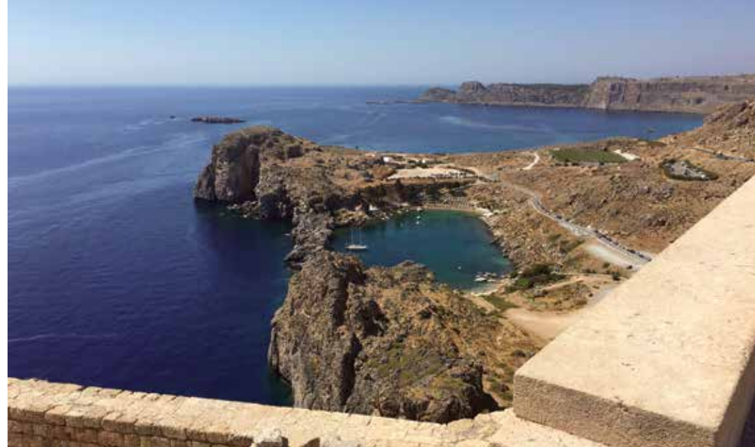
View from Acropolis of Lindos