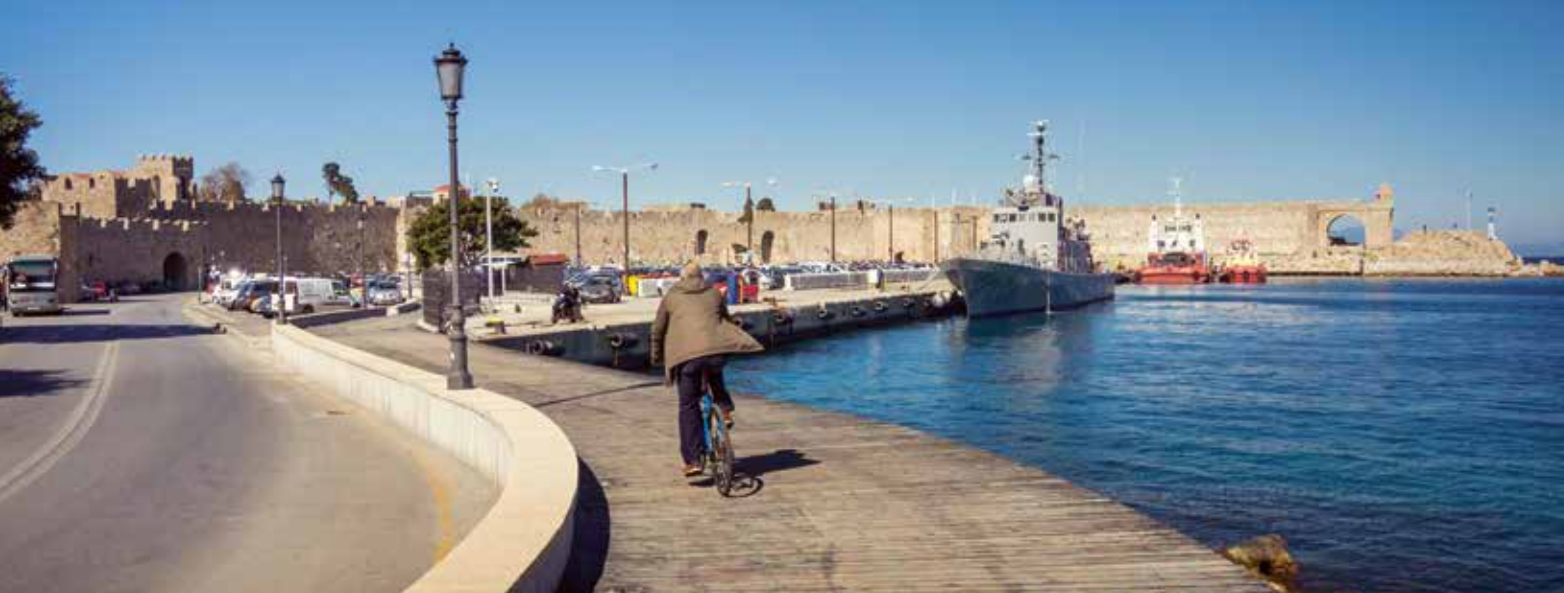
Cyclist peddling toward the city walls of historic Old Town Rhodes