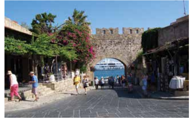
Looking out Milon Gate