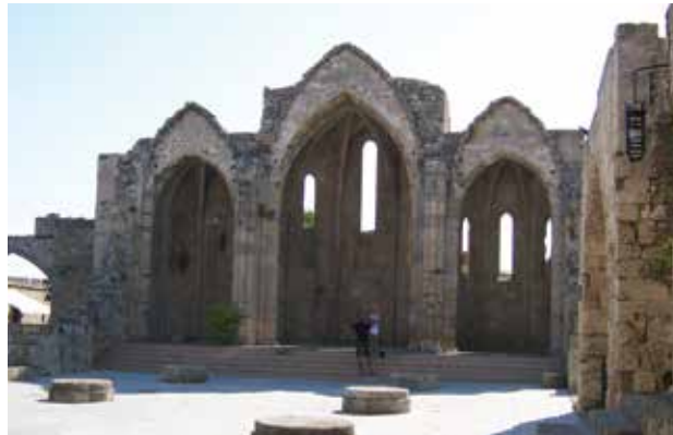
Mary du Bourg Church Ruins