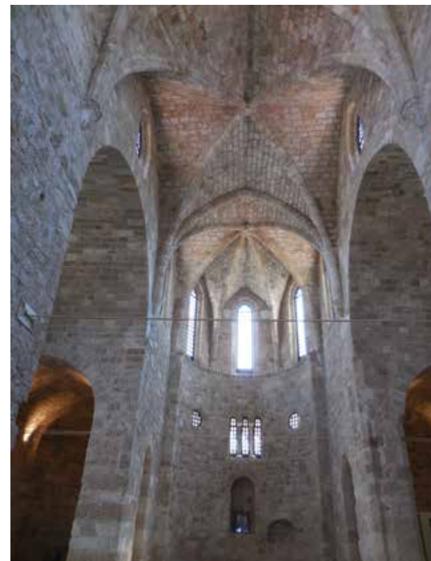
Our Lady of the Castle, Old Town

Managing Director, Max Planck Foundation for International Peace and the Rule of Law, Heidelberg; former President and Judge (Germany), International Tribunal for the Law of the Sea; Dir. Em., Max Planck Institute for Comparative Public Law and International Law