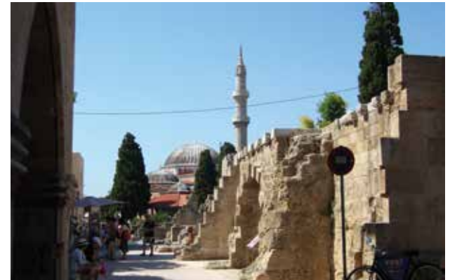
Looking towards Suleyman Mosque