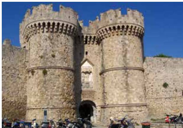
Rhodes sign; Stadium on the Rhodes Acropolis; Marine Gate