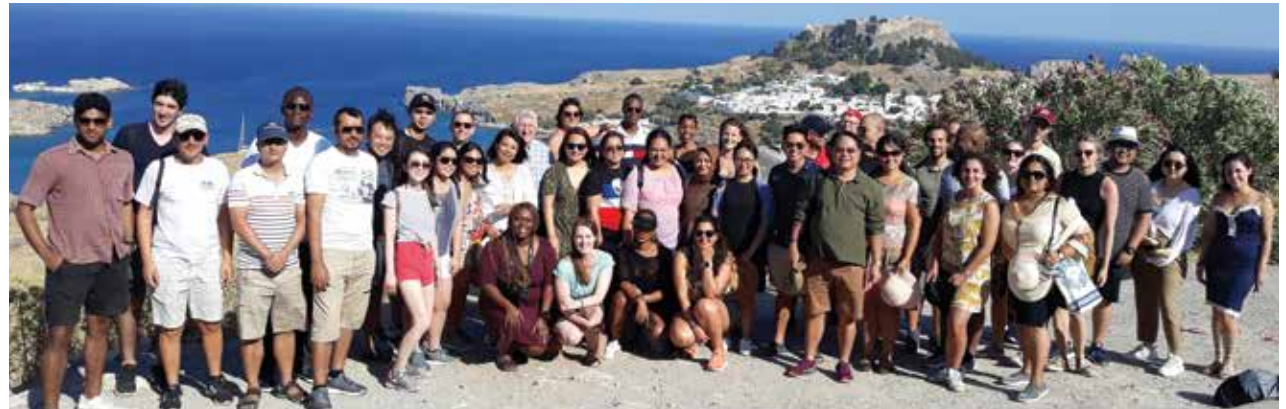
Class of 2019 on day trip to nearby Lindos

http://dehukam.ankara.edu.tr/en/about-us/