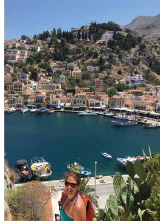
Day trip to the island of Symi