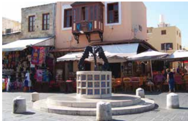
Square of the Jewish Martyrs