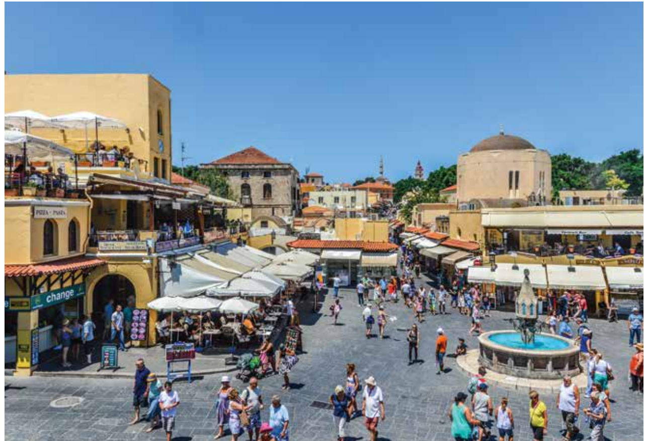
Old Town Rhodes